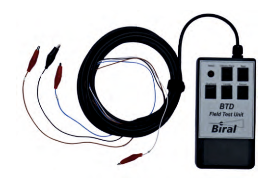
BTD-300 Field Test Unit

The BTD-350 Field Test Unit is a simple battery powered device which simulates lightning in several range bands. It can be used as part of commissioning tests or during routine maintenance activities to enhance user confidence.