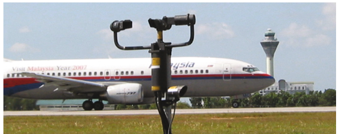
VPF sensors were the first forward scatter sensors to be used in a UK CAA approved RVR system on a CAT III runway.

The features that make the VPF-750 suitable for aviation applications are equally applicable to national weather service networks and research applications.