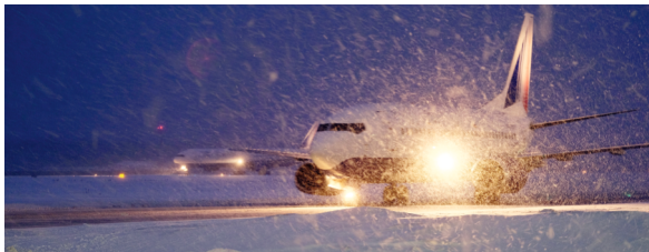
The sensors physical design is optimised to ensure accurate measurement even within challenging environments.

The operational life of a VPF series sensor is well in excess of ten years, even in a marine environment, due to the hard coat anodise finish applied to the aluminium enclosure. The calculated Mean Time Between Failure (MTBF) is over 6 years, however field return data gives a figure in excess of 35 years.